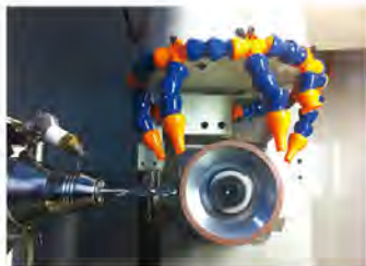
精密的修磨设备 High Precision Machine

专业修磨硬件 准备 Special Machine For Regrinding