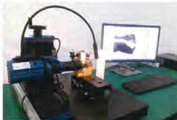
高精度的检测设备 Mearsuring Machine